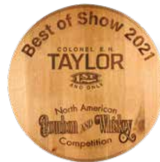
Laser-engraved NABWC "BEST OF SHOW" Barrel Head

Only U.S. and Canadian-made whiskeys can compete for the coveted, laser-engraved NABWC "BEST OF SHOW" Barrel Head.